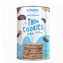
Krunz Cookies & Cream Thin Cookies 80g Krunz 曲奇&奶油薄饼干 100克