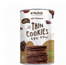
Krunz Dark Chocolate Thin Cookies 80g Krunz 黑巧克力薄饼干 100克