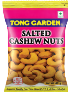
Tong Garden Salted Cashew Nuts 40g Tong Garden 盐味腰果 40克