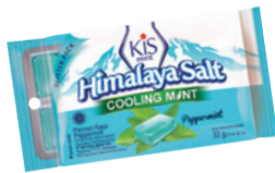
Kiss Himalaya Salt Cooling Mint Peppermint 32g 喜马拉雅海盐 清凉薄荷 32克