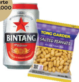
Bintang Beer 330ml + Tong Garden Salted Nut 50g 星星啤酒 330毫升 + Tong Garden盐味花生 50克