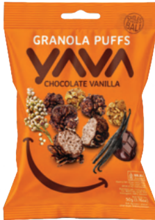
Yava Granola Puffs Chocolate Vanilla 50g Yava 格兰诺拉香草味巧克力 50克