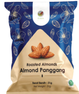
Francis Roasted Almond 31g Francis 焗杏仁 31克