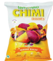
Lemonilo Chimi Sweet Potato Roasted Corn 40g Lemonilo Chimi 烤玉米风味红薯片 40克